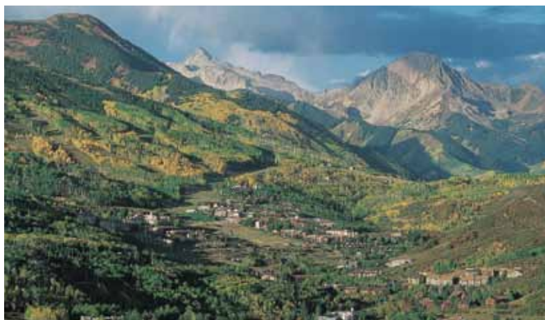
Snowmass in Summer

The hotel features complimentary Aspen Airport shuttle service, outdoor heated swimming pools and whirlpools, health club & spa, sauna, steam room and massage service. Full concierge and business services are available. Brothers' Grille is on property and the many restaurants and shops of Snowmass Village Mall are merely steps away. Silvertree Properties will offer traditional hotel rooms, studios and condominium units.